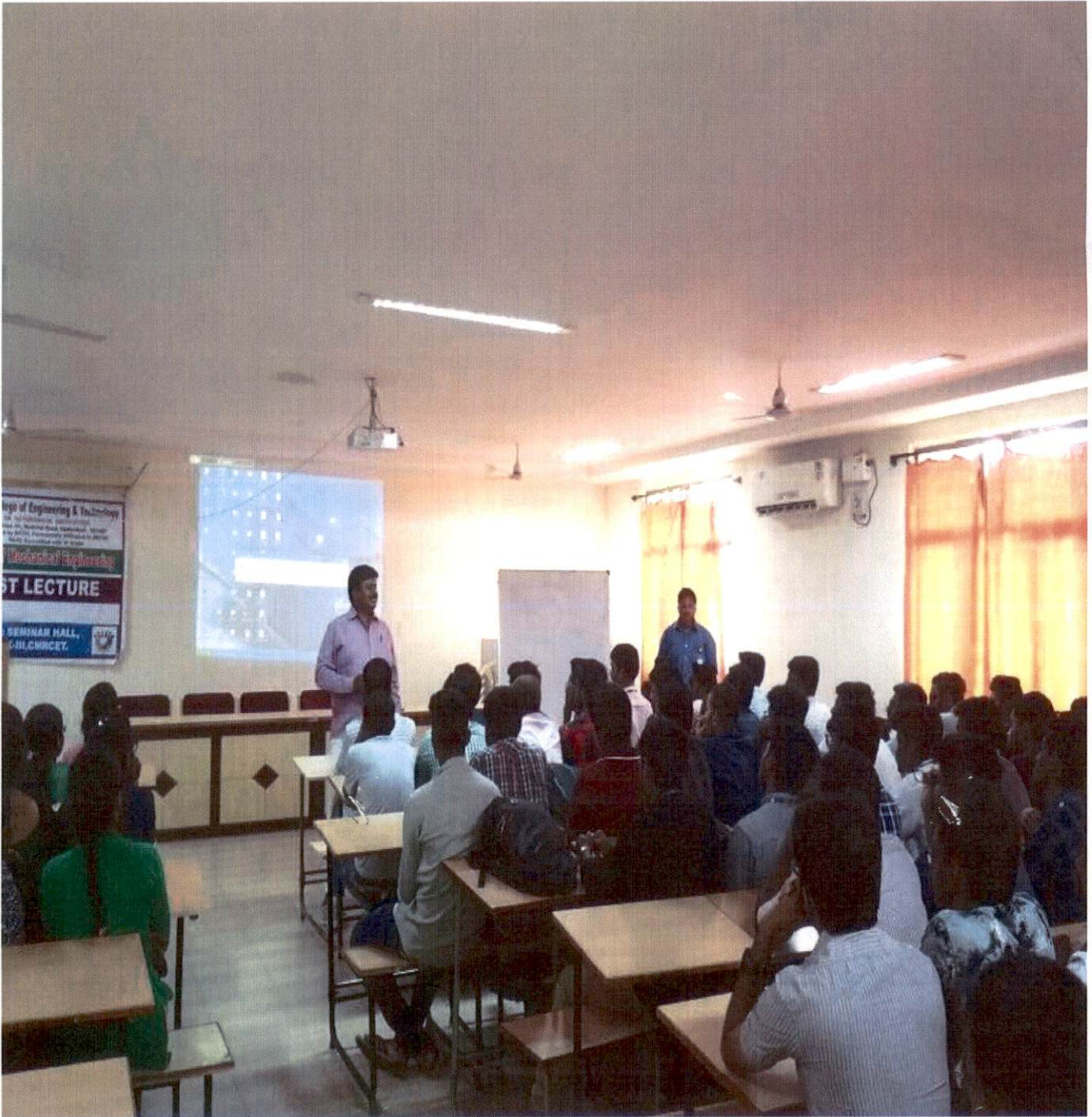
Guest Lecture on Career counseling of SC/ST students 19/09/2015