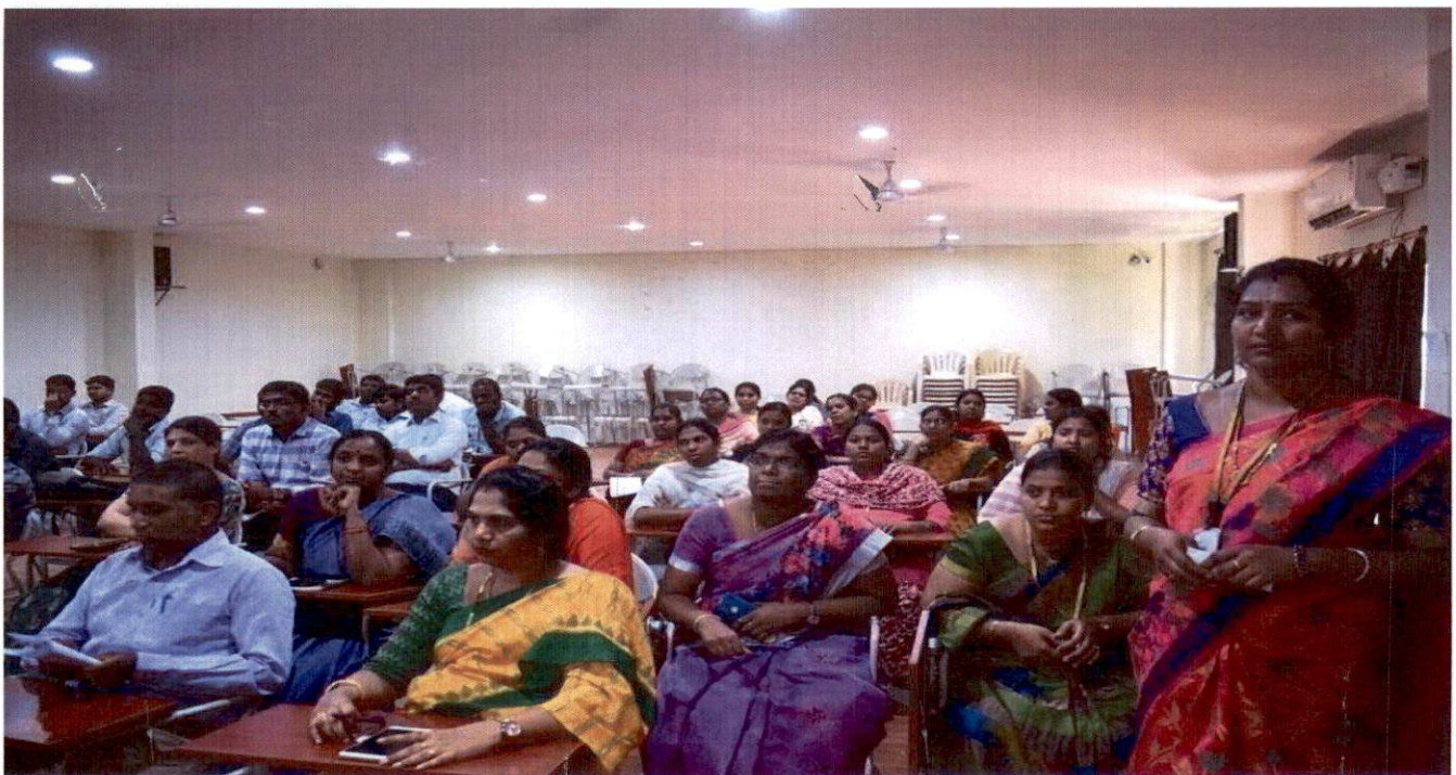
Celebrations of Babu Jagjivan Ram Jayanthi on 05/04/2016